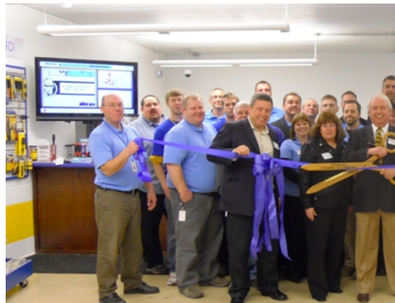
Pictured are Werner Electric Employees cutting the chamber ribbon signifying business is open at their new location W238 N1777 Rockwood Drive (formerly owned by W.O. Distributing Company)

Werner Electric Open House January 20 a big success! at Shakespeare Wealth Management